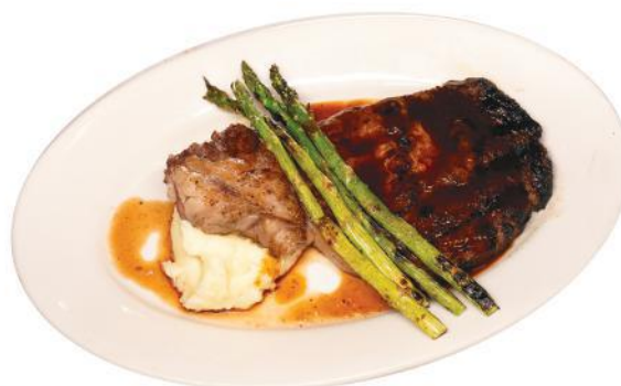
RIB EYE STEAK