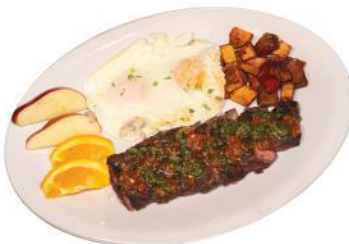
STEAK & EGGS WITH CHIMICHURRI SAUCE