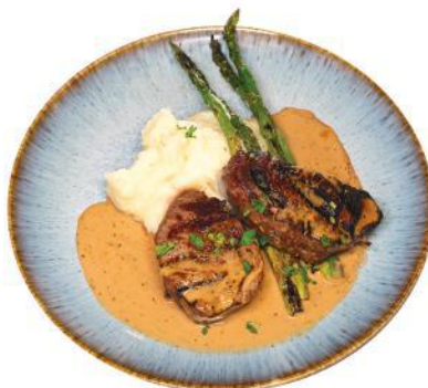
TWIN 4 OZ FILET MIGNON