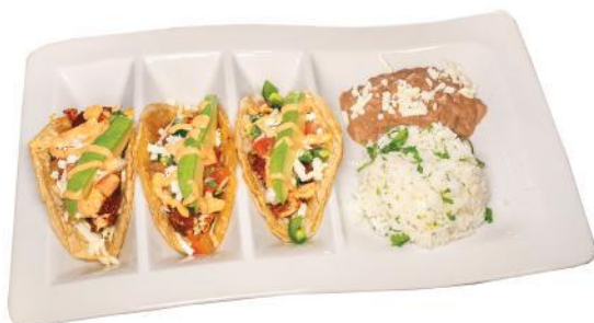
BLACKENED FISH TACOS