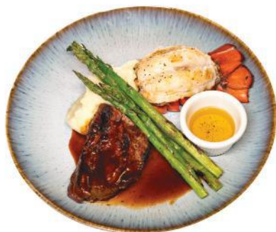
SURF N TURF