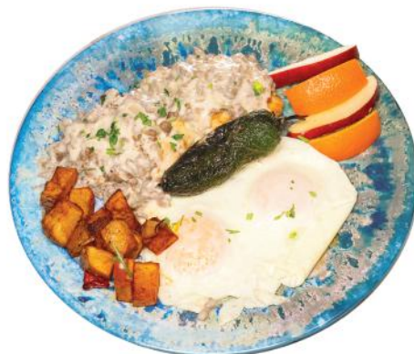
CHEDDAR JALAPENO & GRAVY COMBO

Consuming raw or undercooked meats, poultry, seafood, shellfish, or eggs may increase your risk of foodborne illness, especially if you have certain medical conditions.