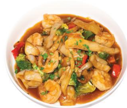
STIR FRY SHRIMP NOODLE