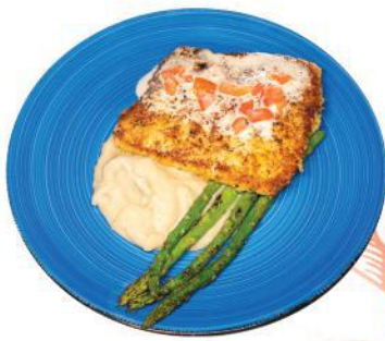
LAKE SUPERIOR WHITEFISH